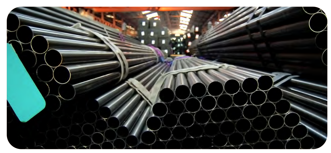
Differences versus Previous Versions

PERE = Use of renewable primary energy excluding renewable primary energy resources used as raw materials; PERM = Use of renewable primary energy resources used as raw materials; PERT = Total use of renewable primary energy resources; PENRE = Use of non-renewable primary energy excluding non-renewable primary energy resources used as raw materials; PENRM = Use of non-renewable primary energy resources used as raw materials; PENRT = Total use of non-renewable primary energy resources used as raw materials; PENRT = Total use of non-renewable primary energy resources; SM = Use of secondary material; RSF = Use of renewable secondary fuels; NRSF = Use of non-renewable secondary fuels; FW = Use of net fresh water